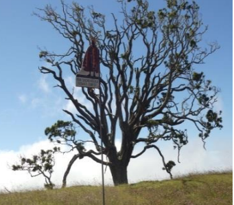
A 3 year old Koa tree... The Majestic 75 year old Koa Ali'i Wahinenui

Next monthly meeting July 10th, 2013...Wahiawā Police Station Conference Room ... 7:00 pm until pau...Join us!