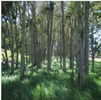
Well along their way...doing fine!