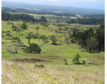
Overview of the 27,000 acres...