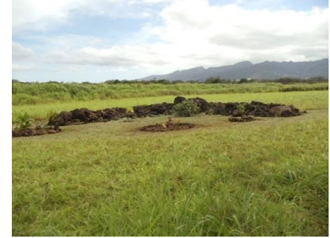
so much to do but the paehumu is pau...