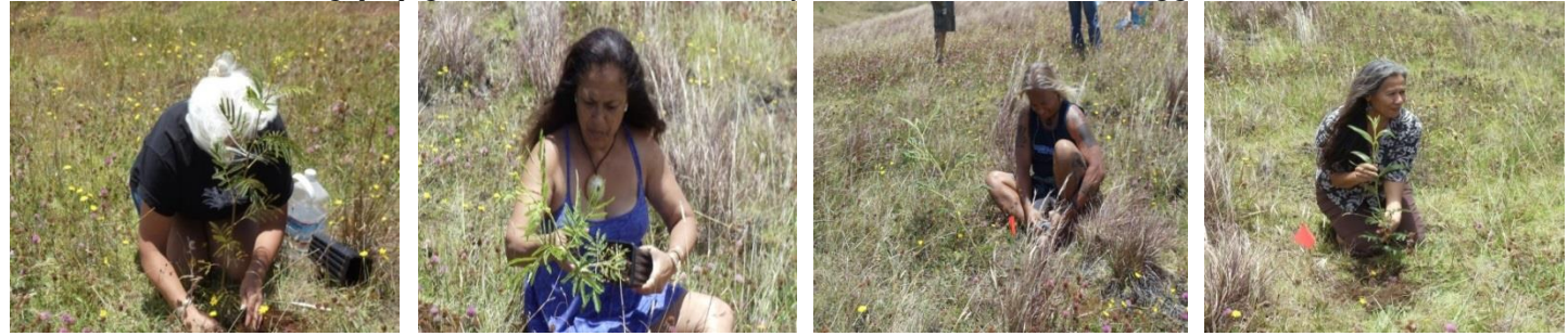
We each planted a Koa tree for someone special. Our certificate indicates where and when they were planted for future reference or visits.